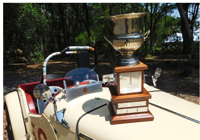
Jack Archibald Cup