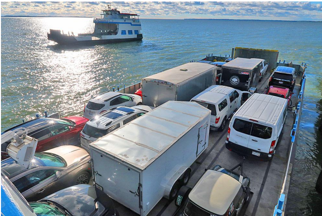
On the way to Put in Bay

The island community of Put in Bay, AKA the "Key West of Lake Erie" is closer to the Canadian border than the Ohio shore. Through the 50's the resort community emulated Watkins Glen and Elkhart Lake in seeking to extend the tourist season with Sports Car Races run through downtown and around the island. Present day, after an exciting re-enactment on the original streets, the races are held on the airport runways - FAA approved!