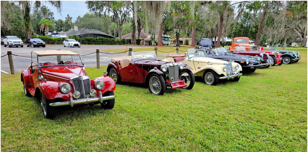
A healthy group of T Series MGs were driven to the picnic. (one MGB snuck into the photo)