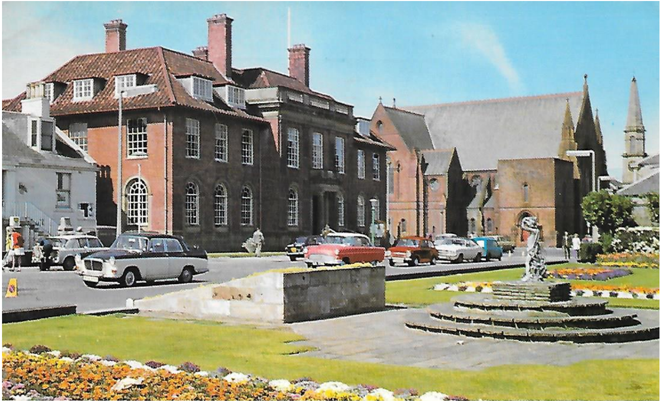
Municipal Buildings, Troon