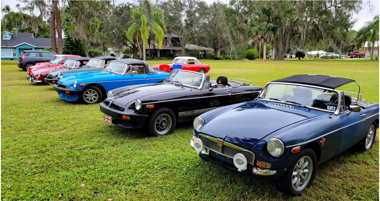
A line of MGBs and newer stretched across the field.