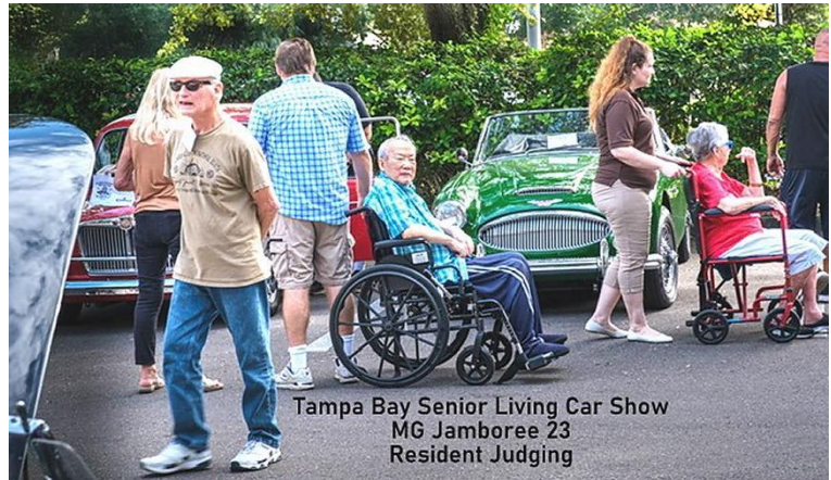
Tampa Bay Senior Living Car Show MG Jamboree 23 Resident Judging

The car show warmed our hearts and allowed us to give back to the community. We drove to a nearby assisted living facility to display our cars. Residents and staff chose the winning cars and told us about their automobile adventures.