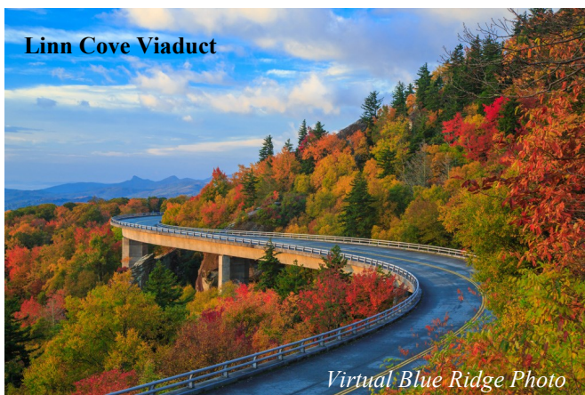
Linn Cove Viaduct