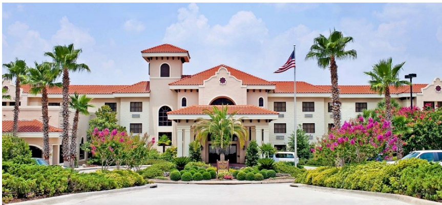
Best Western Gateway Grand, Gainesville Site of GOF 2023 - 4/20-23/23