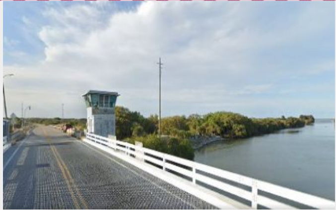
The drive crosses the Haulover Canal

Start at 7:30AM with breakfast at: The Town House Restaurant 139 N Central Avenue Oviedo, FL 32765