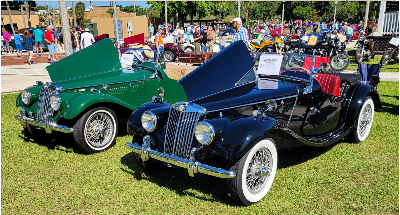
A nice field of MG TDs and TFs participated in the show