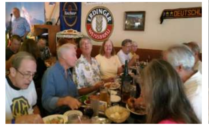
I think I just ate the canary!